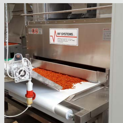
➤ Sanitization of corn 1000 Kg/h throughput