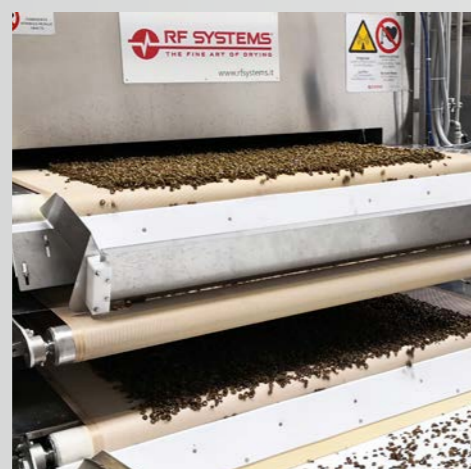
> Drying of candied fruit citrus 1000 Kg/h throughput