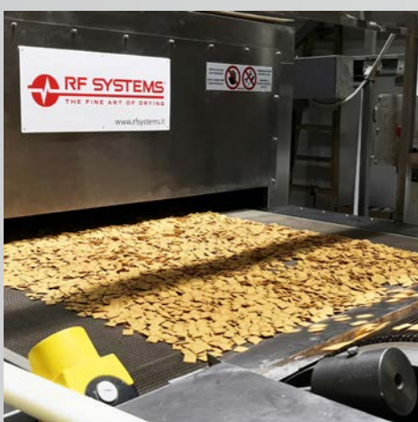
> Drying of crackers 600 Kg/h throughput