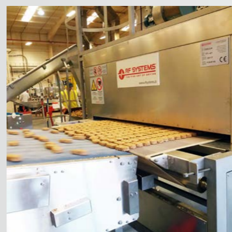
> Drying of cookies 1350 Kg/h throughput